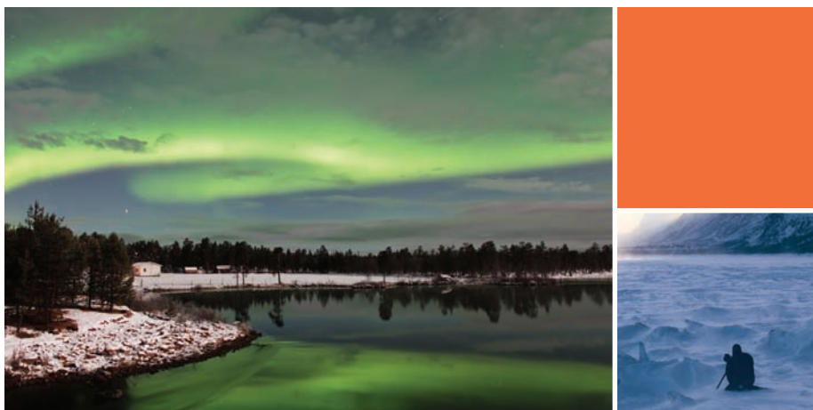
Northern Lights near Inari, Finland and frozen waves on Porsangerfjord, Norway.

The tour starts with three nights at the Hotel Kultahovi in Inari, in Finnish Lapland. Half-board is included in their excellent restaurant, and the superior bedrooms we have reserved have private sauna, and north facing balcony or terrace overlooking Lake Inari. Two evenings will be spent aurora hunting and during the daytime you will enjoy a husky safari, a visit to a reindeer farm and an excursion by snowmobile sledge to the Wilderness Church. From Inari it takes just an hour and a half to reach Karasjok in Norway, where two night Bed and Breakfast are included at the attractive Rica Hotel (see page 7). In the afternoon you travel north to the Porsangerfjord – the innermost reach of the Arctic Ocean – where the frozen waves provide unique photo opportunities! Dinner can be taken in a cosy local restaurant before an evening of aurora hunting in this magnificent location. Next morning you have a guided visit to the Sapmi Park, with a splendid multi-media presentation giving a real insight into the Sami history, culture and mythology. You are then free to explore the Sami 'capital' as you please.