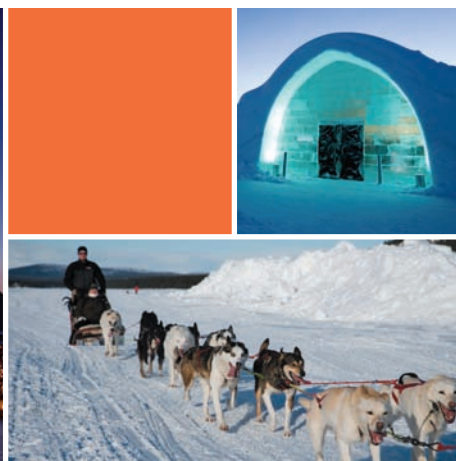
Northern Lights over Tromsø, Ice Hotel entrance and husky safari from Ice Hotel