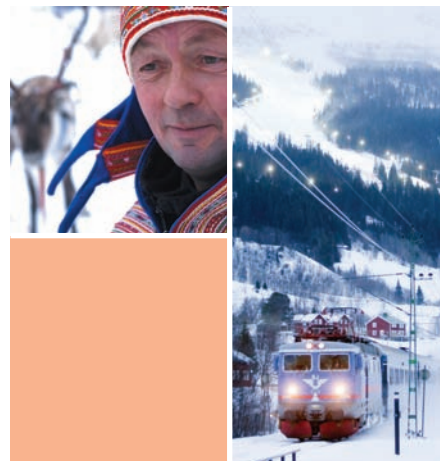
Sami reindeer herder and Swedish train.

“.....two great destinations and a scenic rail journey through the Arctic wilderness”