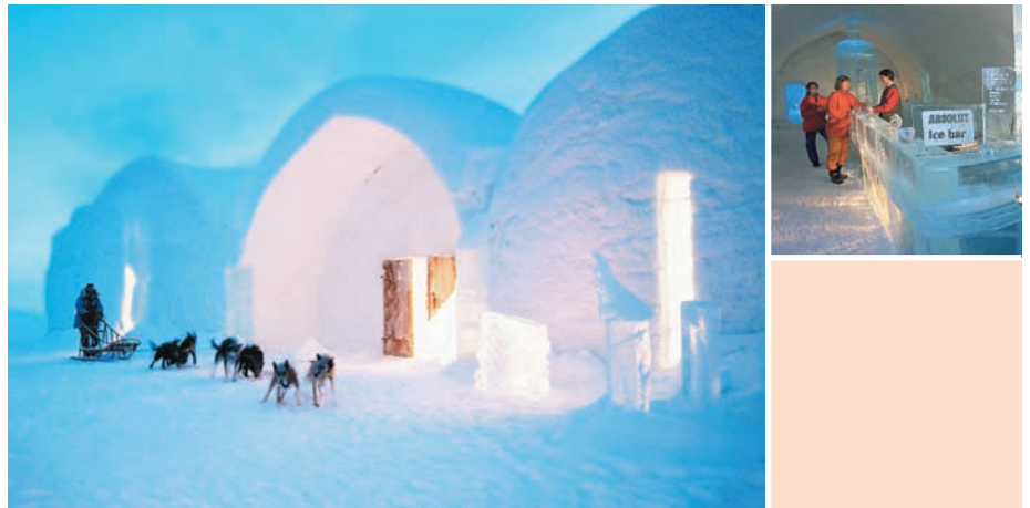
The Ice Hotel and Absolut Ice Bar.

Like all good ideas it has been copied, but Sweden's Ice Hotel remains in a class of its own! Within the complex there are warm hotel rooms and cabins, plus a very attractive restaurant. Thermal clothing and boots are provided to keep you snug and warm throughout your stay and there is a wide programme of activities available. When it's time to relax there's a cosy bar at the inn, or you can enjoy a cocktail 'in the rocks' in the super-cool Absolut Ice Bar.