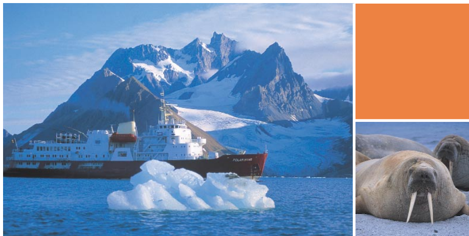
m.v. Polar Star and walrus

FLIGHT SUPPLEMENTS from other airports on request as extra nights may be needed.