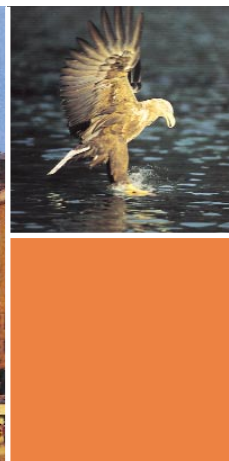
Above: Trondheim; right: sea-eagle.