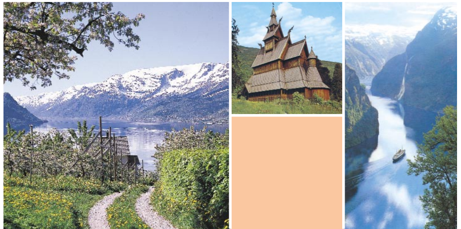
Above: Lofthus; centre; Hoppstad Stave Church, Vik; right: Geirangerfjord.

Loen In a stunning location, on the lovely Nordfjord, Loen probably offers more excursion possibilities than any other centre - especially by car. The Geirangerfjord, the Summer Ski Centre at Stryn, and even pretty coastal villages are all a comfortable day's drive. Closer still are the Briksdal Glacier (also possible by bus), and the Kjenndal Glacier. The latter can be reached on an unforgettable boat-trip on the wild and beautiful Lake Loen, one of the loveliest trips you are ever likely to take. Loen is also a superb base for a walking holiday, with marked trails of varying lengths through spectacular scenery.