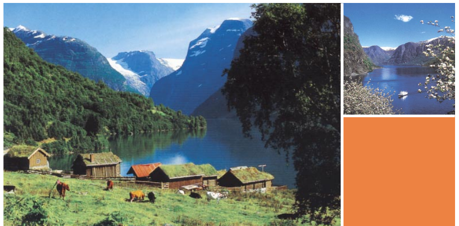
Above: Lake Loen; right: Sognfjord in spring.

“.....enjoy all the classic fjords on this leisurely fly-drive holiday”