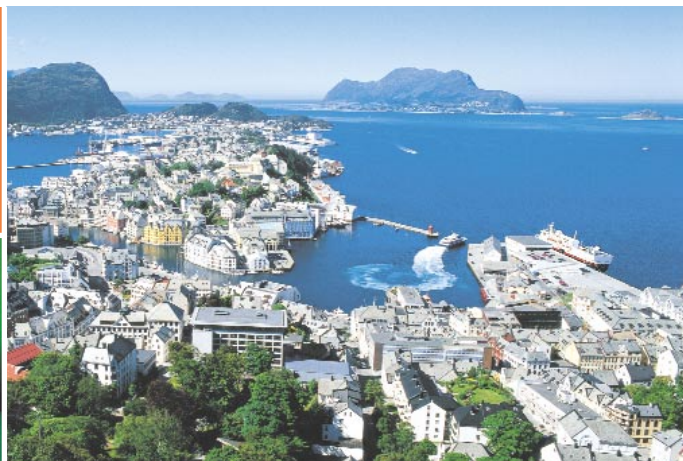
Northern Lights – a possible highlight of a winter voyage, right; Ålesund.