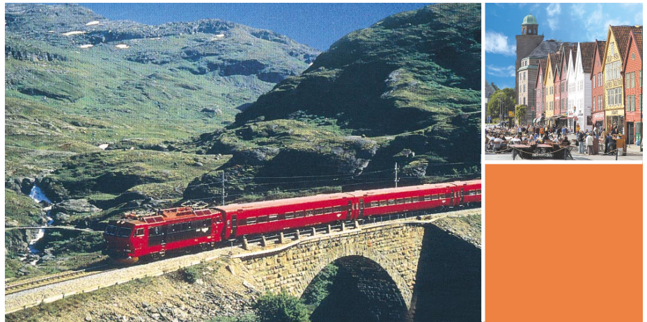
Above: Bergen railway; right: Bryggen, Bergen.

Balestrand This well-known resort has been attracting tourists for over a hundred years. Situated on the Sognefjord it is an excellent base from which to explore this mighty fjord. There are many lovely walks in the surrounding area.