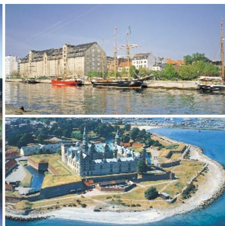
Above: Nyhavn; top right: Copenhagen Admiral Hotel; bottom right: Kronborg Castle, Helsingør.