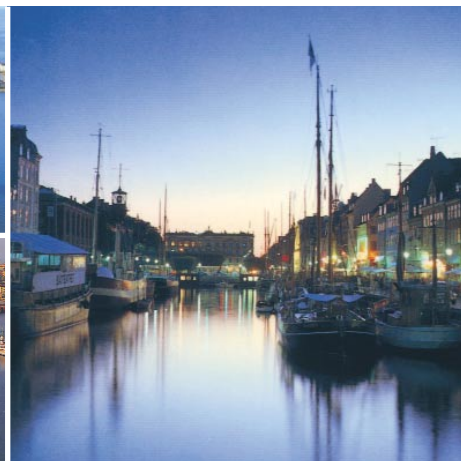
Top: Silja Line ship, bottom; Stockholm; right: Nyhavn, Copenhagen.